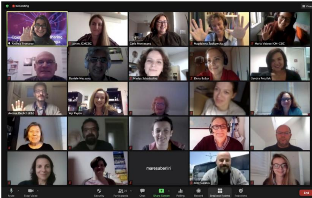
Photo: ResBios project – First mutual learning workshop, October 2020